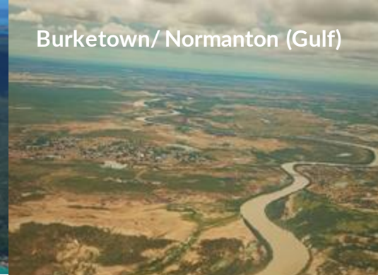
Burketown/ Normanton (Gulf)