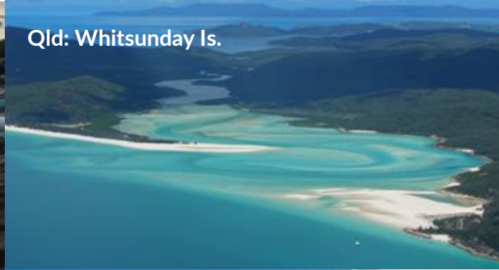
Qld: Whitsunday Is.